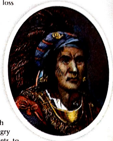
▲ Pontiac, the Ottawa chief, depicted in an 18th-century engraving.

To avoid further conflicts with Native Americans, the British government issued the Proclamation of 1763 , which banned all settlement west of the Appalachians. This ban established a Proclamation Line, which the colonists were not to cross. (See the map on page 87.) However, the British could not enforce this ban any more effectively than they could enforce the Navigation Acts, and colonists continued to move west onto Native American lands.