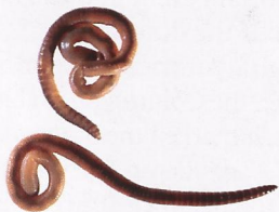
NIGHT CRAWLERS, Lumbricus terrestris

Europeans imported earthworms on the root-balls of plants or in the ballast of ships. Little worms can trigger big changes.