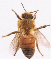
HONEYBEE, Apis mellifera

Without the European honeybee, Georgia wouldn't have become the Peach State; Johnny Appleseed's trees might not have borne fruit.