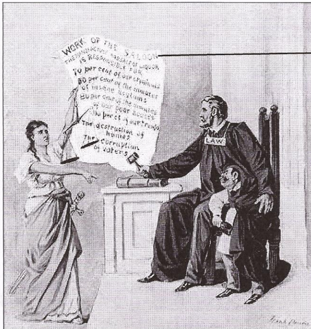
Under the Cloak of the Law

● WORK OF THE SALOON The Manufacture and Sale of Liquor Is Responsible For 70 per cent of our criminals 50 per cent of the inmates of insane asylums 80 per cent of the inmates of our poor houses 100 per cent of our troubles The destruction of homes The corruption of voters