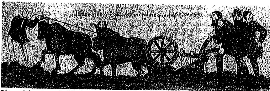
I know it's a drag, Godric, but it's progress

Homo sapiens wrought havoc on many ecosystems as Homo erectus had not